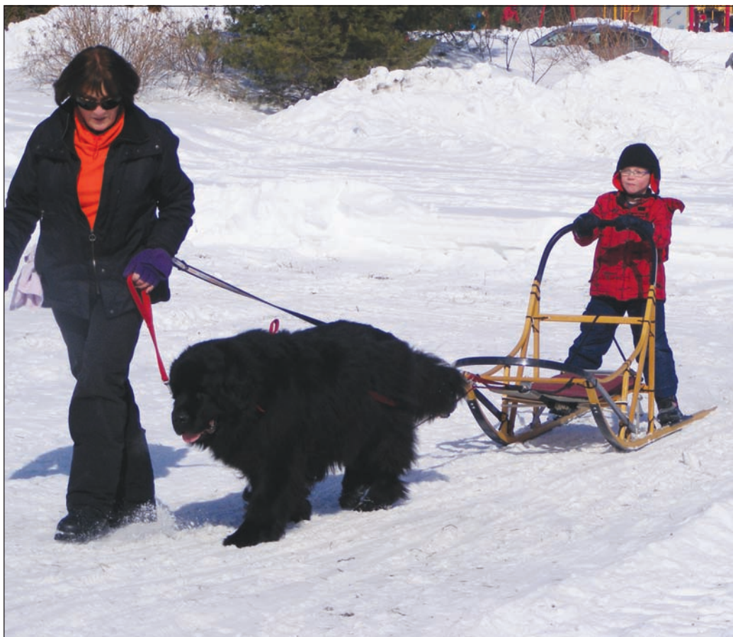
Members of The Good Guys Dog Carting were at Caledon's annual Snowfest recently. It's reported to be the number one family attraction at this event.

For more, visit www.thegoodguyscartingdogs.ca or email info@thegoodguyscartingdogs.ca .