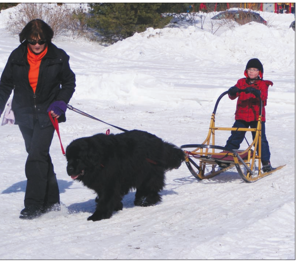
Members of The Good Guys Dog Carting were at Caledon's annual Snowfest recently. It's reported to be the number one family attraction at this event.

Participating dogs are properly trained guyscartingdogs.ca.